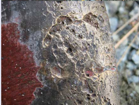
Severely Corroded Bronze Propeller