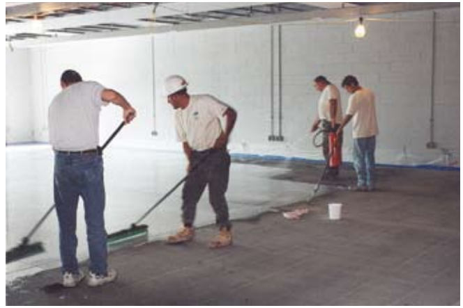
Fig. 2: Spray-applied reactive penetrants combine with alkalis within the concrete, reducing the pH and permeability to moisture vapor