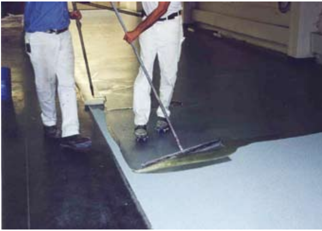
Fig. 4: Special epoxy- and copolymer-modified cementitious overlays are used as a separation layer between the base concrete and the applied flooring system