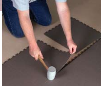
Fig. 8: Some nonadhered, interlocking tiles can be used when high moisture emission levels are present. Concrete beneath the tiles must be shotblasted to open the surface so any moisture condensing beneath the tiles can be reabsorbed by the concrete

Many floor covering and coating manufacturers have experience with one or more systems and can help with the selection. The company providing the mitigation system should also provide a verifiable warranty that covers all costs associated with any flooring problem that may develop as a result of their system failing to perform. Typical full coverage warranties are available for periods up to 10 years.