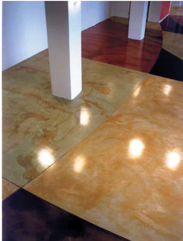
Fig. 7: Stained cementitious overlays provide a durable, decorative surface for concrete slabs on and above grade. They allow the designer and owner almost unlimited options of patterns and colors

The best approach for avoiding moisture-related flooring problems is designing and constructing a concrete slab for which ground moisture is taken completely out of play and ample time is provided for the concrete to dry internally to a safe level.