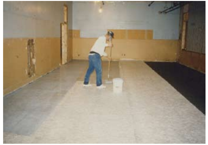
Fig. 5: Fiber mat membrane can be adhered directly to a prepared concrete surface or applied over certain penetrants and approved coatings to provide a moisture diffusion path