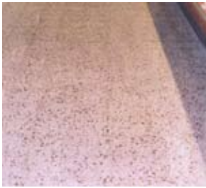
Fig. 6: Polished concrete surfaces serve a decorative function, while allowing moisture vapor to escape

time. Such floor finishes are easy to maintain and can be produced in colors or brought to a terrazzo appearance (Fig. 6).