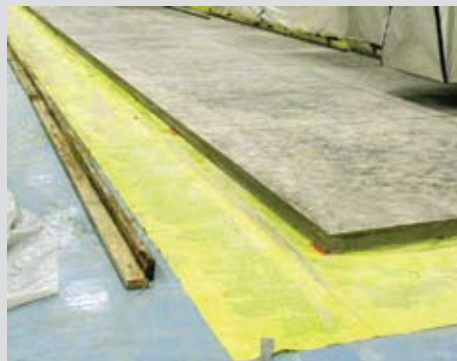
If an existing slab was built with no vapor retarder beneath it, a new slab, placed over a vapor retarder, is one renovation option